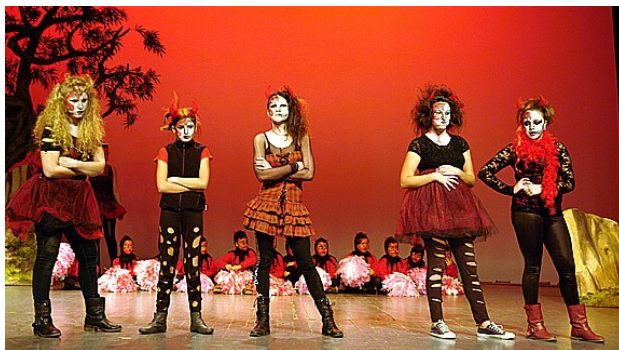
Beasts of the hell

smart and brave, so the audience sometimes tells them when the evil characters appear behind them. Everybody knows the story, and children usually interact with the actors. Some families see this play every year or participate in it, because it's a tradition. Satan and Lucifer are not terrifying. Children aren't scared because the story is a popular comedy based on a serious fact, the birth of Jesus.